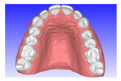
Figure 5: Upper arch preview from occlusion