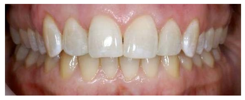
Figures 8 and 9: Post-treatment pictures