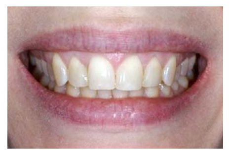
Figure 7: Frontal view after less than seven months treatment