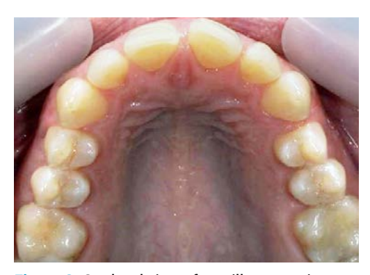
Figure 3: Occlusal view of maxillary anterior spacing

to have the malalignment corrected with a therapy which should be as invisible as possible. The severity of the spacing was immediately apparent from a frontal view (Figure 1). However, the mal-alignment is also clearly seen when viewed laterally (Figure 2) or from occlusion (Figure 3)